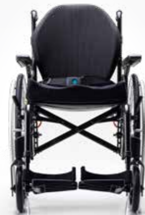
Action 3 NG