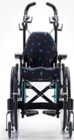
Action 3 Junior